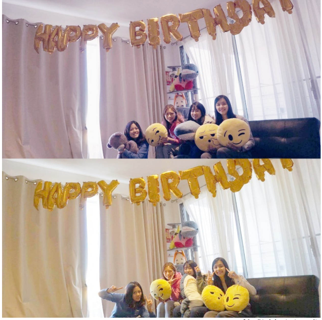
21st Birthday in Australia