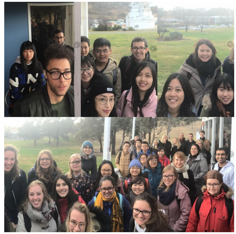
Inbound Exchange Students