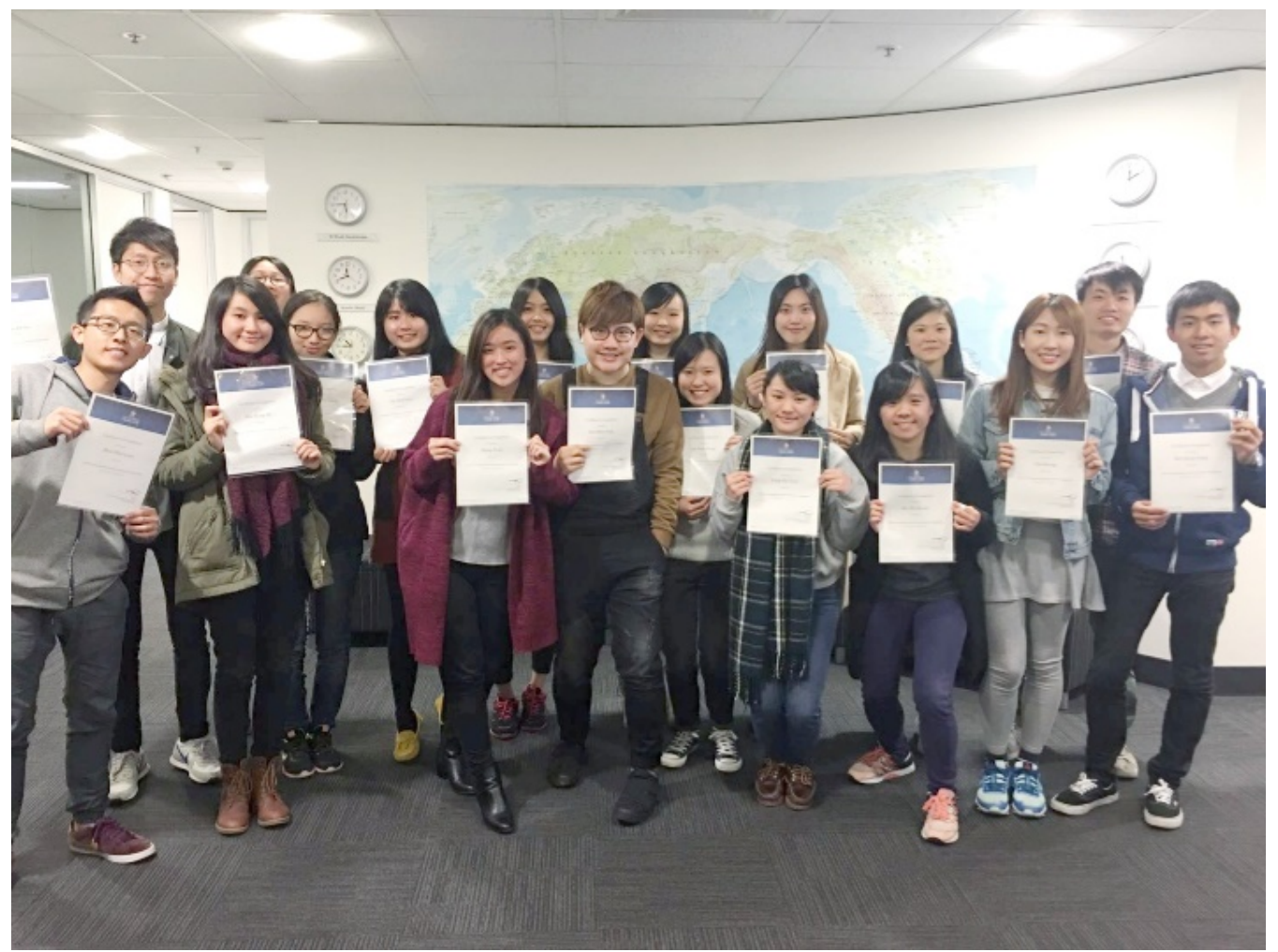
Culture and Language Immersion Scheme for Professionals (CALIS-Pro)