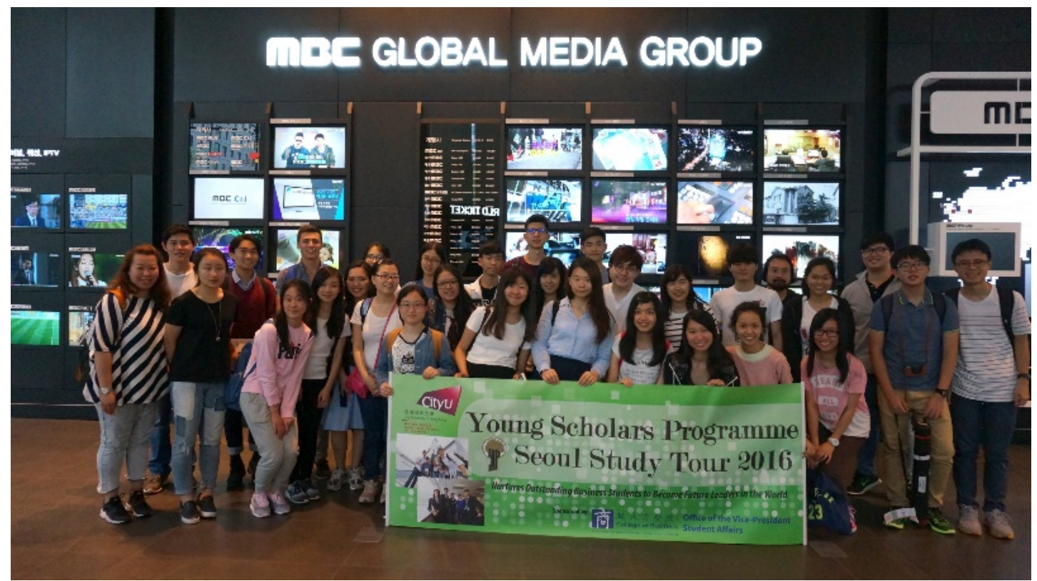
YSP Seoul Study Tour 2016