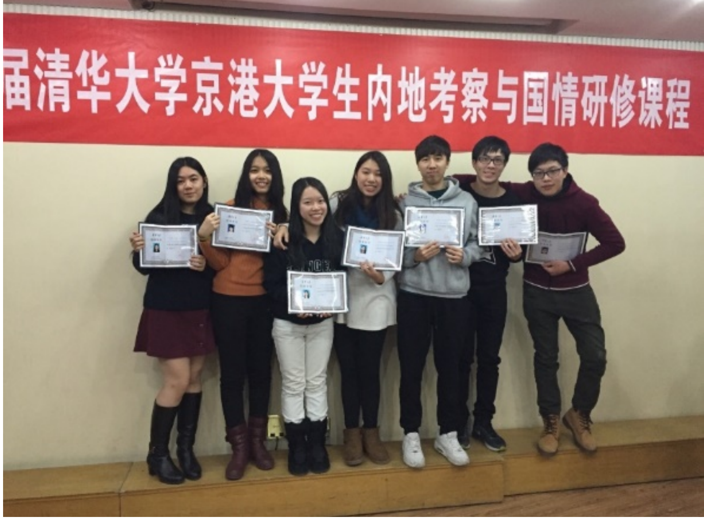
Tsinghua University Study Tour