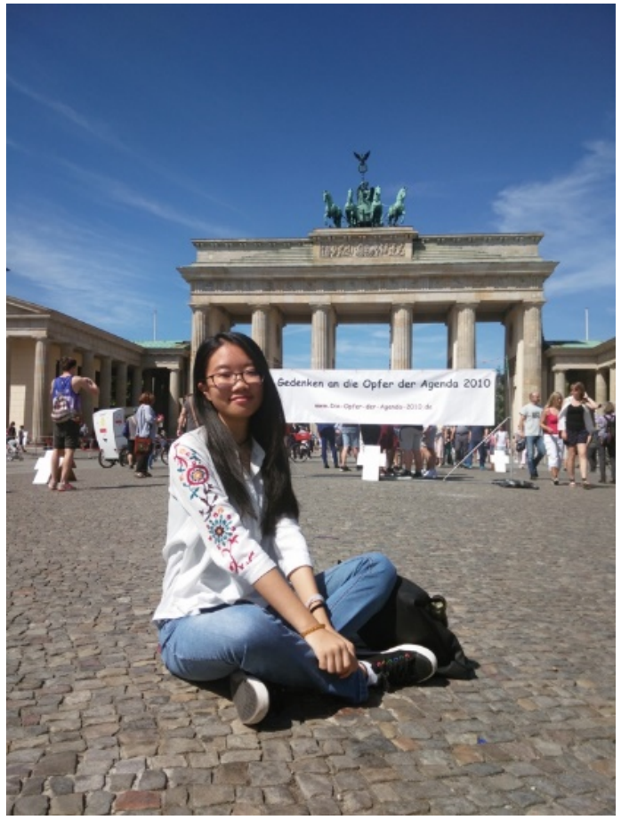
In front of the Brandenburg Gate in Berlin