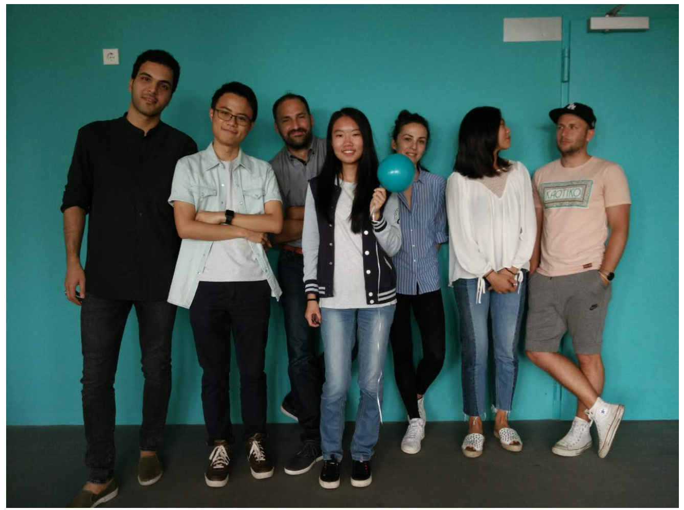
With Finance Team of the company