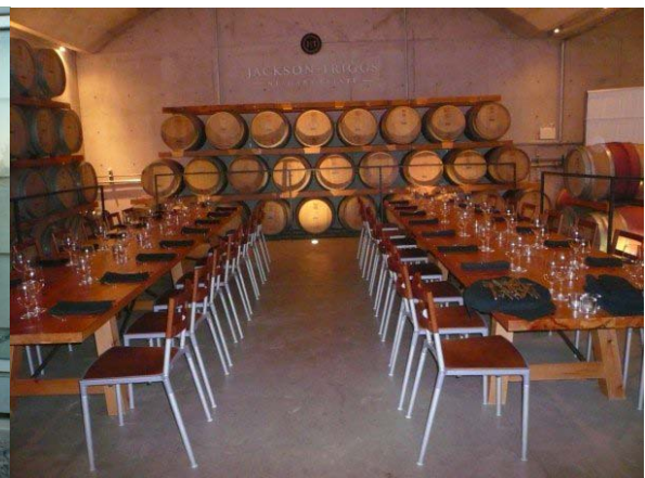
The wine vault in Winery

The introduction of Wine is the most of difficult courses I have ever studied in University. The course is about study the process of production wine, the history of wines in different countries, a individual project and tasting different wine during the laboratory once a week. The course schedule is a 2 hour lecture and 2 hour laboratory per week. Because we need to taste different wines during the laboratory, so it required students must be a minimum of 18 years of age and a material fee of $1000 in Hong