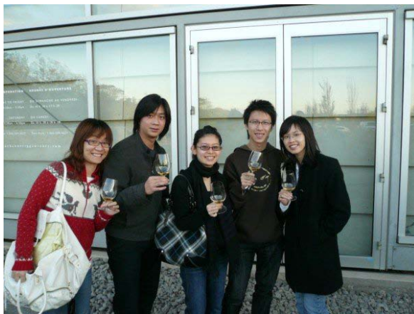
Tasting wine during winery visit