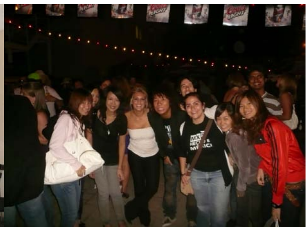
Party in Brock University