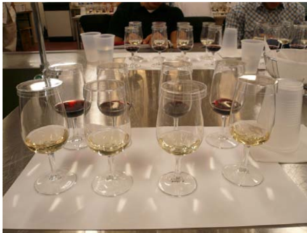
Tasting wines during the class