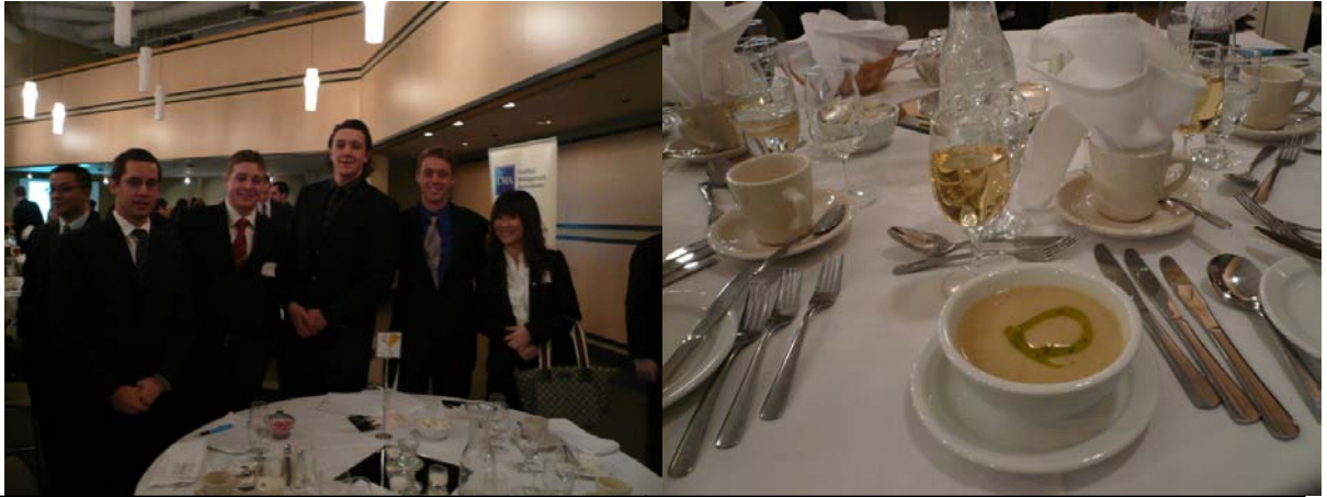
My table mates in Etiquette Dinner