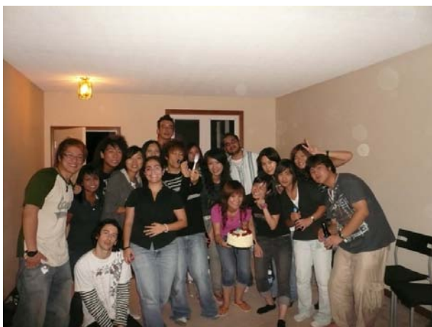
My Birthday party