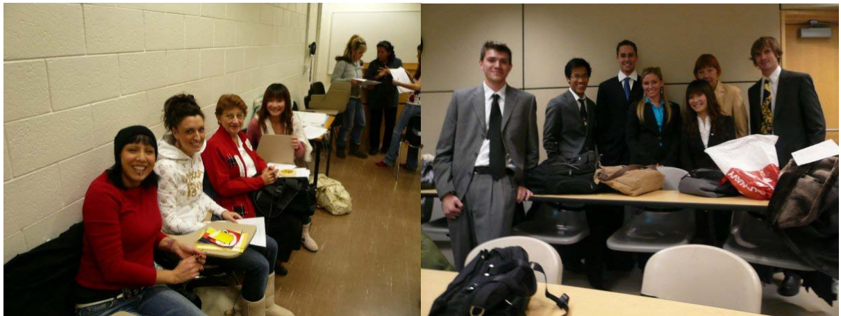
My group mates in Introduction to Wines and Women's Issues: Sexuality, Class, and Ethnicity

I have studied four subjects in Brock University in Semester A 2007-2008. They are Business Strategy, Internet Marketing, Introduction to Wines and Women's Issues: Sexuality, Class, and Ethnicity respectively.