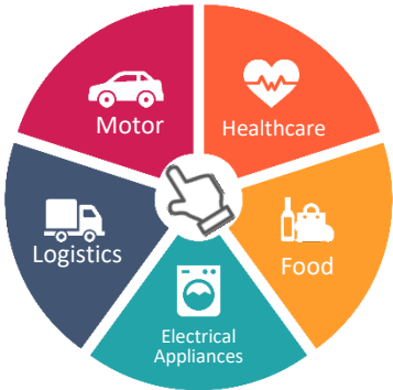
Vertical Rotation Within Business Unit

We discuss with MTs about their career aspirations, formulate career plans that balance the needs of the business and MT's professional development, regularly review their progress, and offer coaching and advice where there is necessary to help MT achieve goals.