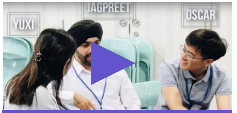
2018 July Programme Video