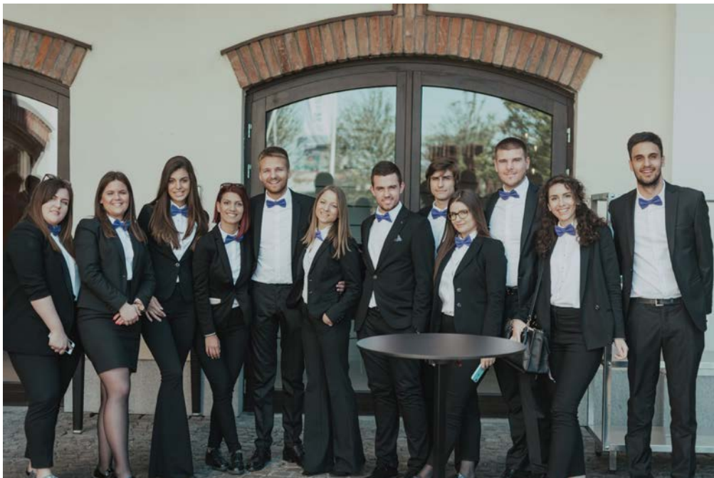
BBICC 2018 ambassadors