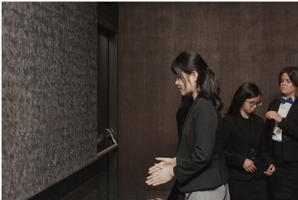
I practiced hard before the formal presentation

During the presentation, we believed that only when we had a strong position could we convince others. We were very lucky to get intensive feedback from the jury members composed of consultants and company representatives. To our delight, the jury admired our idea of an app for the game Monopoly to engage and attract startups and offer an advisory service to help them raise capital. One of the jury members gave us first place. As a young entrepreneur, he encouraged us: “Do not be afraid of thinking about crazy ideas. It is such a wonderfully safe platform for your experiments!”