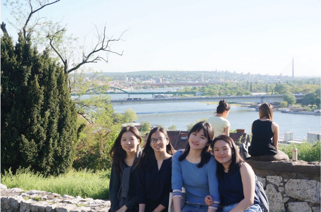
The treasured landscape of Belgrade, Serbia.

Apart from the intense competition, cultural tours were also a highlight of the journey. In the “Amazing Run,” we stepped into the city of Belgrade, which I had never visited. Located at the intersection of the Sava River and Danube River, Belgrade is the capital of Serbia where the old meets the modern. The modern district is under rapid construction, whereas the old streets and gardens are well preserved. Serbian people told me that the city had been destroyed many times yet has been rebuilt in a tenacious way. A strong spirit has been cultivated and is reflected in the landscape and architecture in addition to people’s lifestyles.