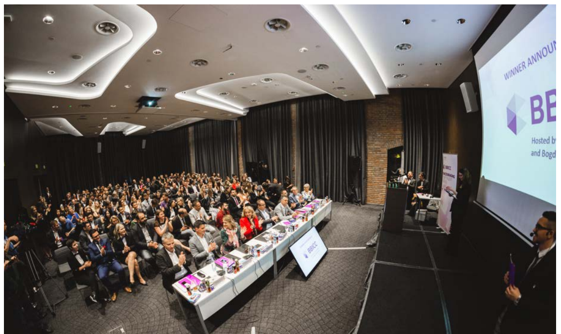
Final grand presentation

Although we did not enter the final, we got the chance to observe the presentations from the best teams, from the National University of Singapore, Queen’s University, Washington University and others. I came to understand how there was room for improvement.