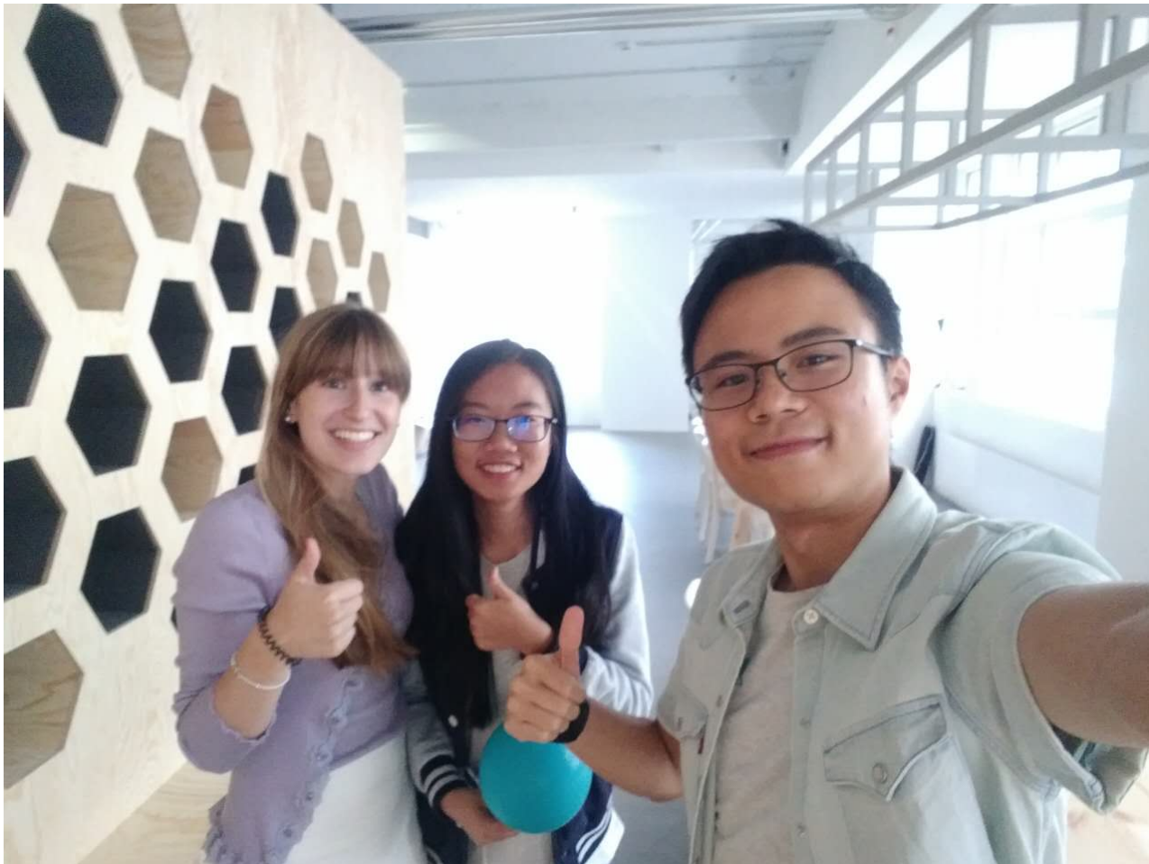
Friends in the company