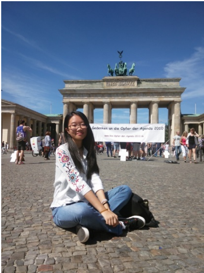
In front of the Brandenburg Gate in Berlin