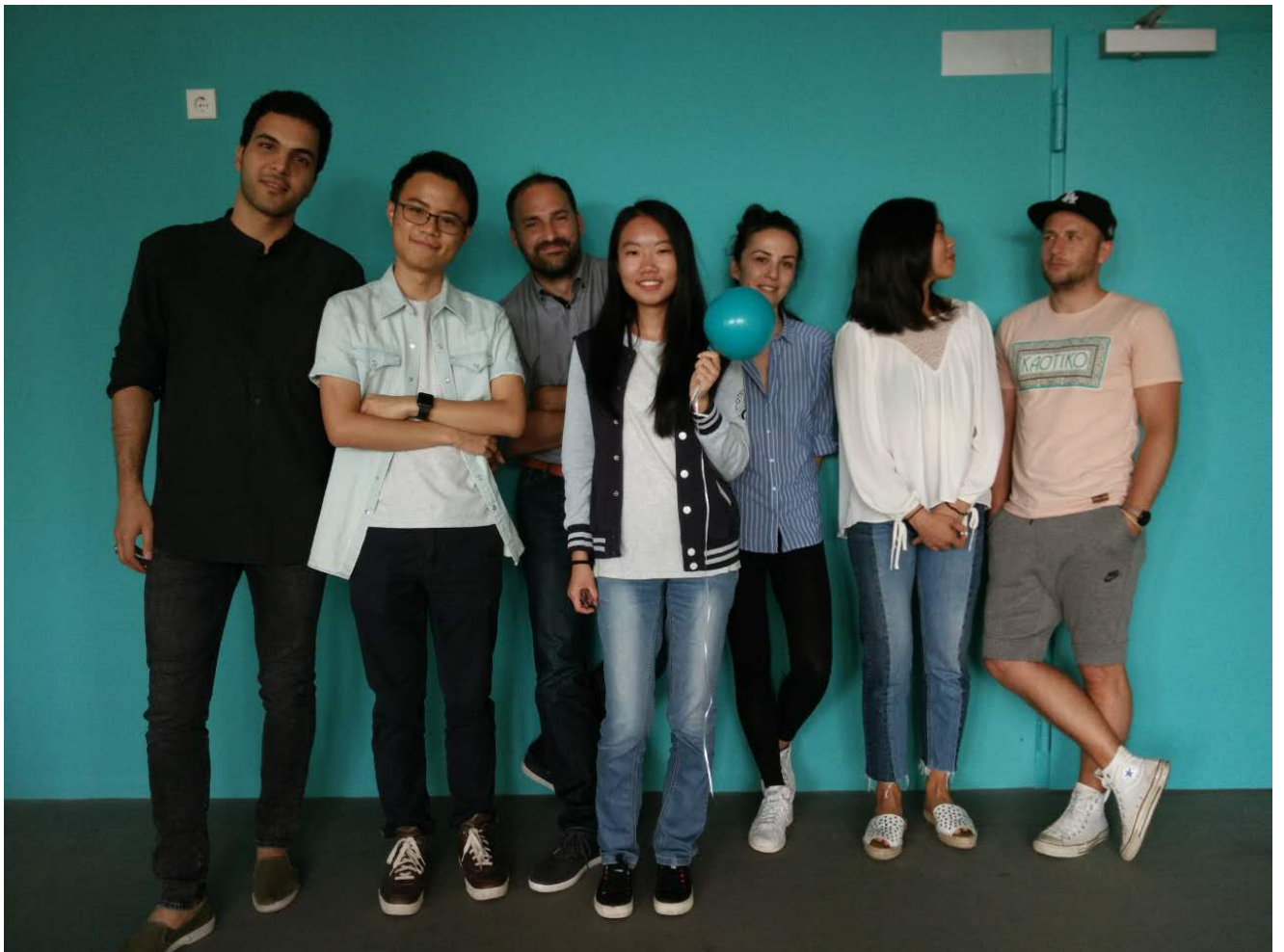
With Finance Team of the company