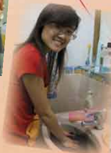
Doing housework and cooking for ourselves