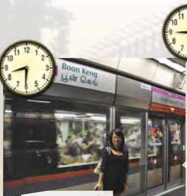
Squeezing into the crowded subway

Recently, two groups of students joined the Singapore internship programme, working in Foo Kon Tan Grant Thornton and RSM Chio Lim Stone Forest. They conducted audit work with their team, helped senior officers, and had a great time after work. Let's see how they spent their days in Singapore!