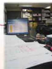
Conducting audit work at the client's office and discussing with managers