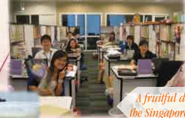
A fruitful day during the Singapore internship