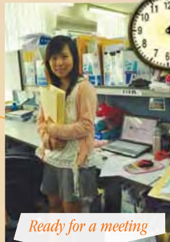
Ready for a meeting