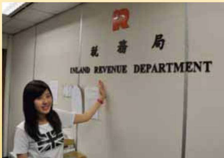
AC students spent a meaningful summer at the Inland Revenue Department as interns

During their internships, the students learned how to work precisely and accurately, enhanced their understanding of taxation and compliance, handled various cases and improved their time management. Overall, the experience was very fruitful.