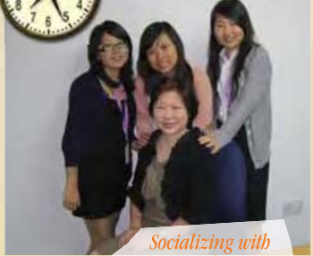
Socializing with colleagues after work