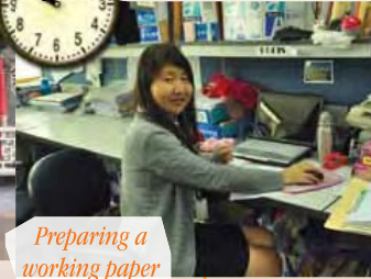
Preparing a working paper