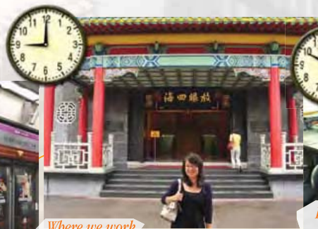
Where we work