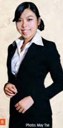
8