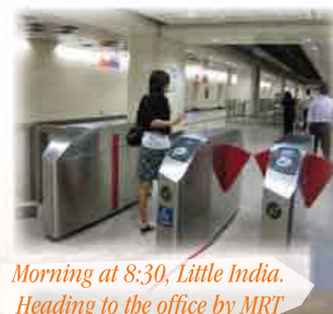
Morning at 8:30, Little India. Heading to the office by MRT