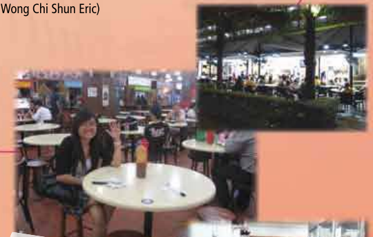
Having a delicious meal after work – Hainanese chicken rice S$3.50