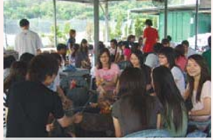
A great number of people participated in the fun event

a causal setting. Mentors and mentees could dine together and exchange information with each other. Smiling faces and laughter could be found everywhere. This activity indeed helped foster harmonious relationships between mentors and mentees.