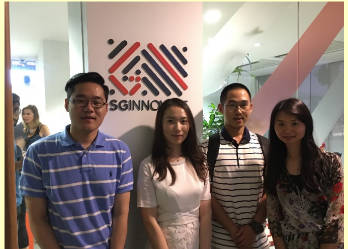
Visit to SG-Innovate