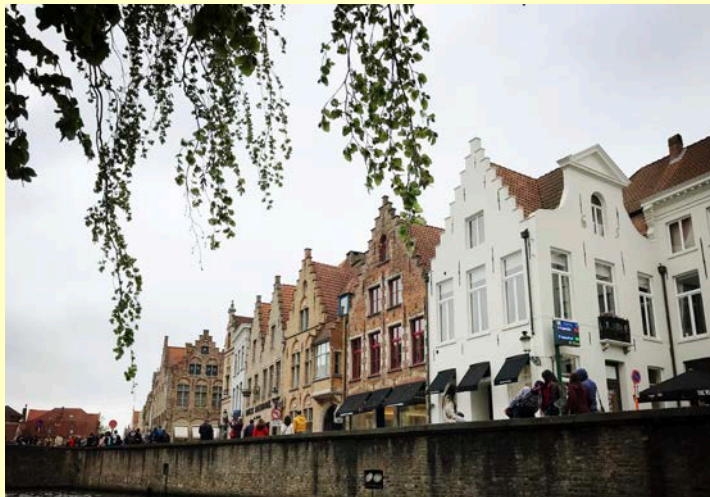
A day trip to Bruges, a beautiful canal-based city in northern Belgium.

I have a hobby of visiting museums and galleries in my leisure time, and Brussels is just the right place for me. Museums in Brussels feature a wide variety of themes, including classic arts and national history that are commonly seen subjects, and special ones such as comic strips, chocolate and lace. Some of the museums are large, like the Royal Museum of Fine Arts, while others are small