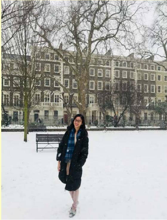
Snowy day outside the University College London campus

can tell you that it is definitely not the truth. As the postgraduate study only lasts for one year, the syllabus of teaching is well organised and it's hard to find any time for travelling, or even enjoy a full English Breakfast during limited sun-drenched days (as sunny days in London are quite rare). I spend most of my days at the university library. On Saturdays and Sundays, it is hard to find a seat for studying if you arrive a little bit late at the library. Every day, I am surrounded by numerous versatile and talented classmates. My classmates fully demonstrate the spirit of "play hard and study harder". The academic atmosphere inside the long-established school since 1826 is inspiring.