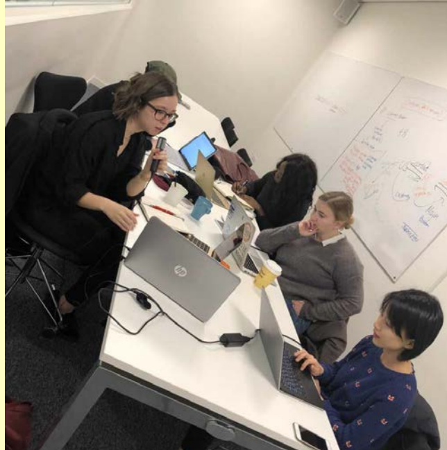
I attended Women in Finance webinar with student leaders from other programs.

mathematical and statistical side of finance, but also in-depth analysis involved in quantitative financial modelling. Apart from taking highly specialized finance modules such as Financial Engineering, Empirical Finance and Financial Statistics, we were required to acquire various programming languages including Python, MATLAB and C++ through compulsory coding modules. Besides, there were a variety of optional workshops that we could register based on our interests. For example, I attended a trading workshop in which I learned how to react quickly and trade stocks from playing simulated trading games. This also gave me insight into the sales and trading business in investment banks and developed my commercial awareness.