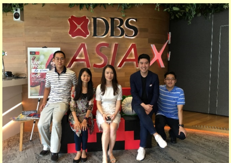
Tour to DBS Asia X