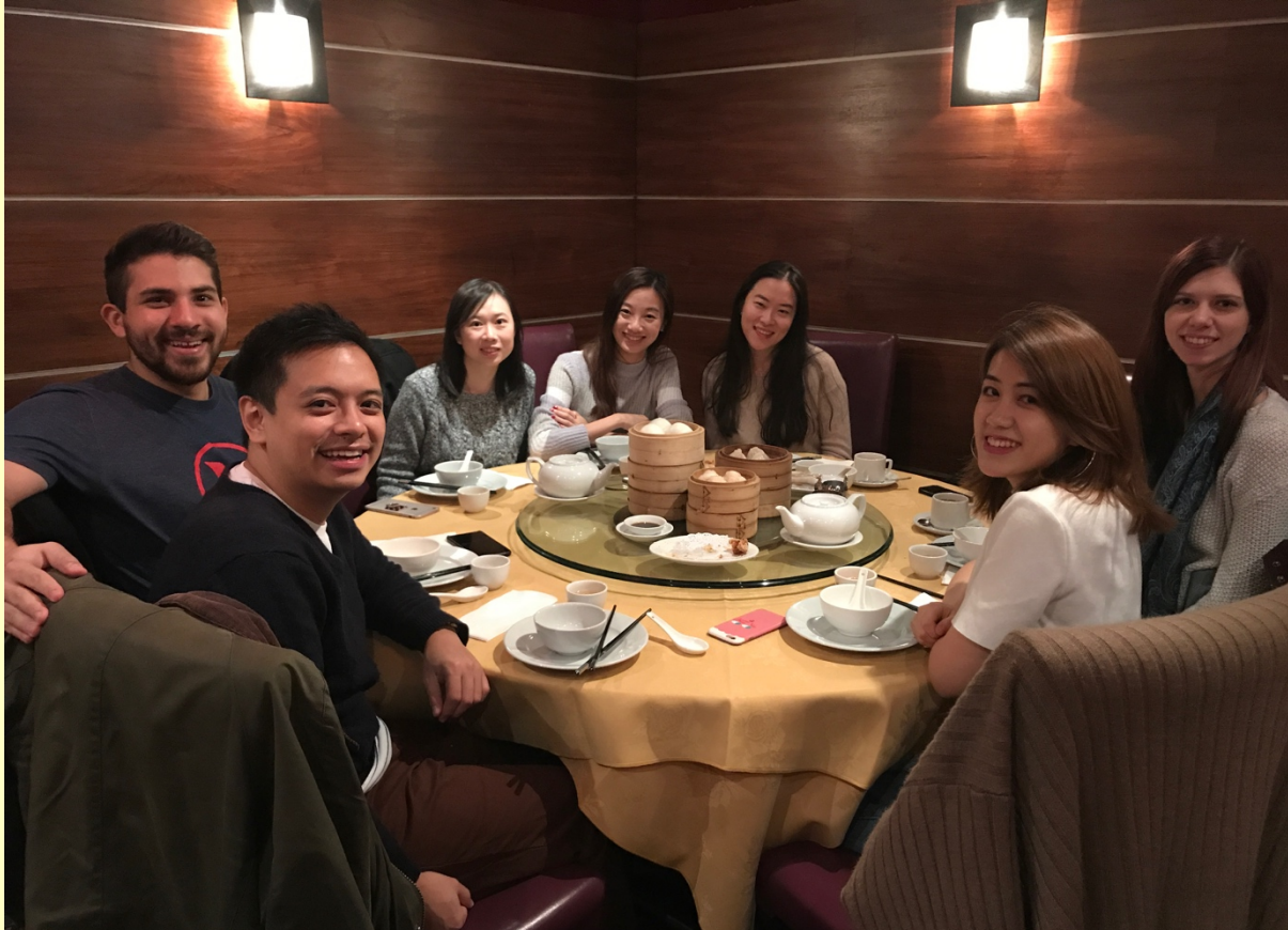
Sunday tea time with my hall mates in China Town