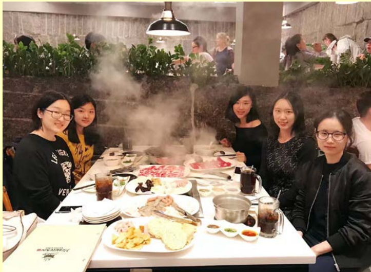
Hot Pot in China Town with friends

fight for what they want. Studying abroad provides us with great opportunities to explore the world while developing critical thinking and independent judging abilities. Surrounded by outstanding professors in academia, professionals from the industries, and top students with high intelligence and excellent interpersonal skills, I am motivated to better myself.