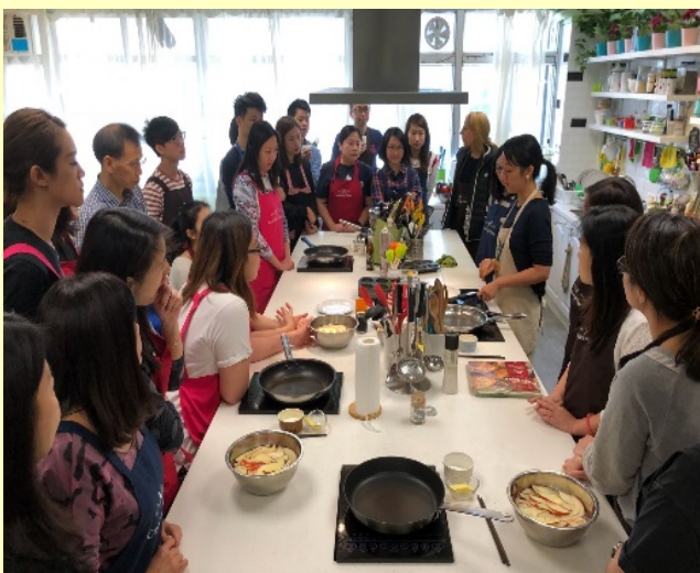
Team building activities