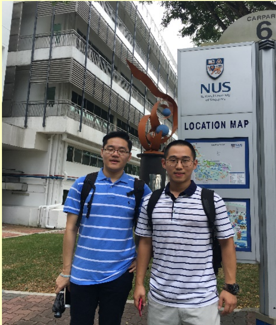
Visit to National University of Singapore

"Bento system incorporates customers' input such as investment objectives and risk