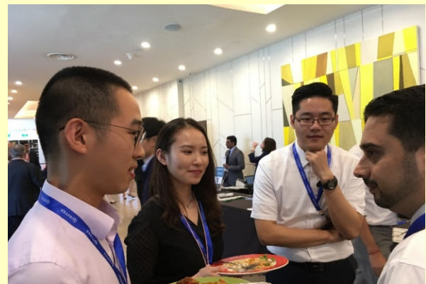
Discussion in 2018 FinTech Innovation Forum