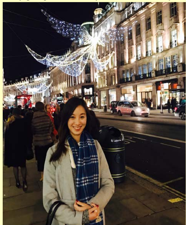
Christmas Decoration in renowned Regent Street, London

In my undergraduate study, I was lucky to be chosen as one of the participants of CityU's exchange programme to Rotterdam, the Netherlands. Initially I thought the exchange is similar to my postgraduate study. Be that as it may, I