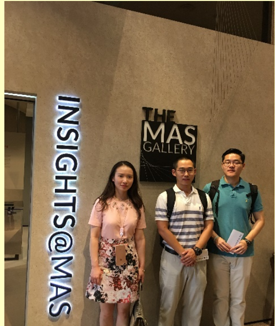
Visit to Monetary Authority of Singapore (MAS)

This study tour to Singapore -- the leading FinTech hub in Asia -- is a very fruitful adventure to all participants. It is indeed an invaluable opportunity for them to develop a multi-faceted perspective on the