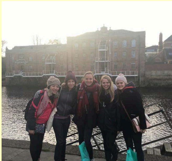
Day Trip to York

I am studying a master's degree in Management Science and Marketing Analytics at Lancaster University now. Although we have a small class, I have plenty of opportunities to meet new friends as there are many activities on and off campus. There are regular day trips