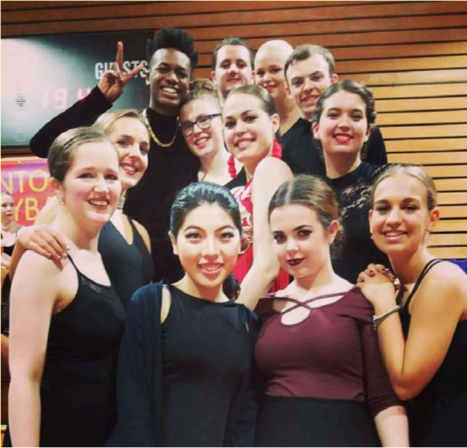
Ballroom and Latin Dance Competition in Leicester

all of these. Even beginners can join competitions specially designed for them. I don't get a lot of opportunities to compete in Hong Kong, or learn social dancing at affordable prices. However, I can do that and enjoy as much as I wish here, in Lancaster. There are even social gatherings once a fortnight, when we will go to clubs, play some games in a house or have a great meal in a fancy restaurant.