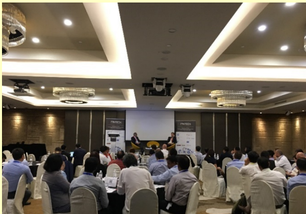
2018 FinTech Innovation