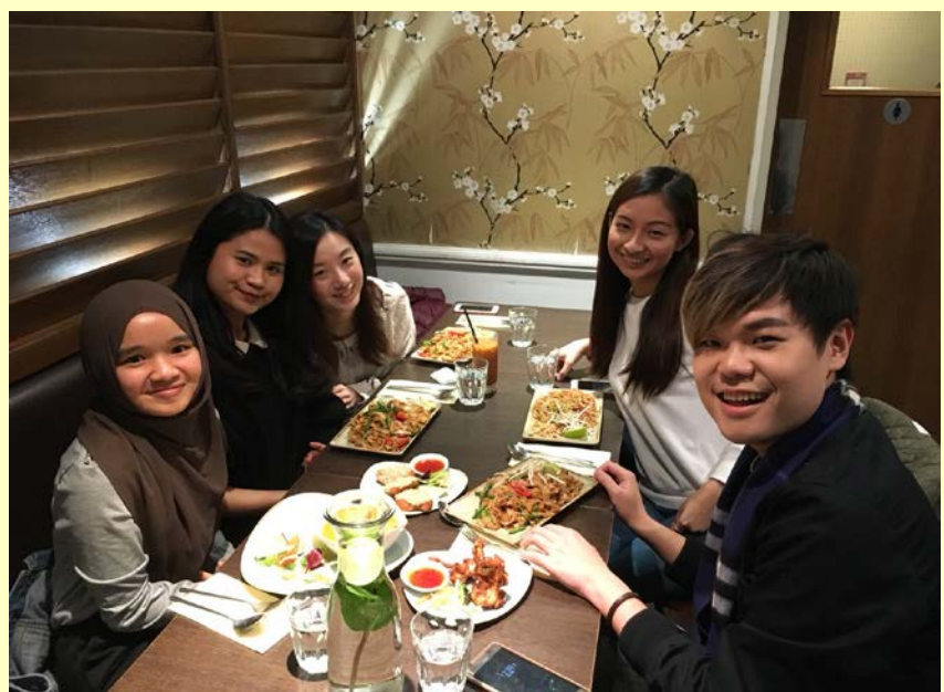
Gathering with my classmates from MSc of International Public Policy

I cherish every moment in my school and also in London. "YOLO – You Only Live once", which is a renowned slang phrase, always reminds me to treasure every second I have. We cannot buy time, but we can plan our time wisely to seize every moment. I am