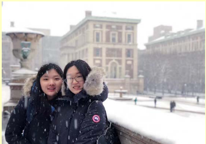
First snow I experienced in NYC

was indeed torturous. I learned Python from scratch and picked up R. Not only did I have to keep an eye on what happens in the market every day, but also quickly get the key points with my own opinions. However, when I look back on what I experienced last semester, I am proud to say that it is rewarding.