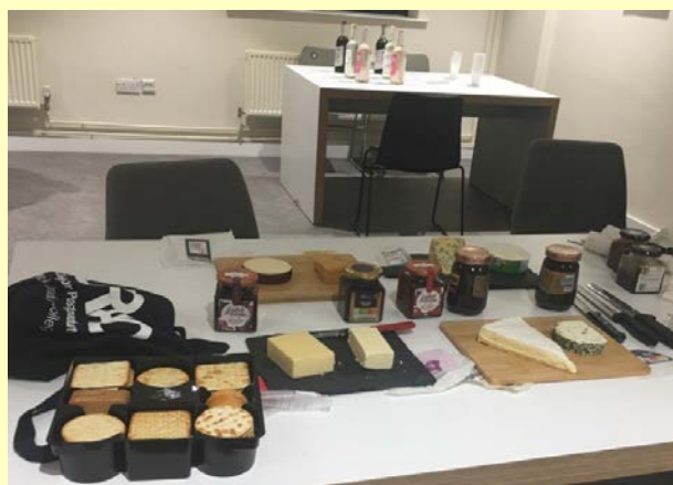
Cheese and Chutney Event in Buddy Programme

showcases. There is an annual charity showcase in February and performance in Blackpool in March. There are also regular competitions in Leicester, Manchester, and Durham. We are free to join any of these or