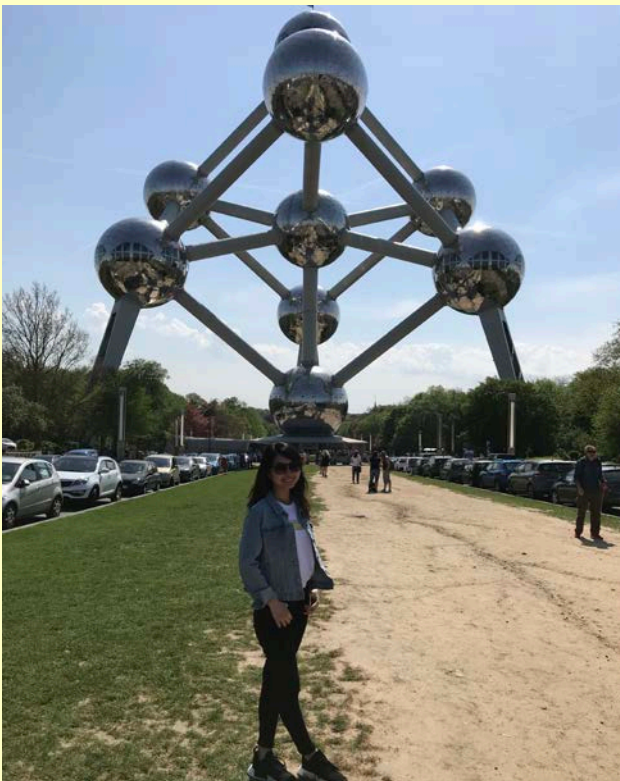
A photo of me taken in front of the Atomium, a landmark of Brussels.

KU Leuven is a university with long history and enjoys high reputation in Europe. There, I attended courses in fields of economics, management and law. Professors in economics classes constantly link theories to daily events and news of Europe and the rest of world, so that a deeper and more vivid understanding of knowledge could be obtained. As far as I am concerned, they also delivered an attitude of academic study that highly emphasise on practical issues. Among the courses I took, Introduction to Law impressed me as I have learned a lot in the class about the history and culture of Belgium. They are strong characters of the community reflected in the development of Belgian law system and juridical principles. Also, in the exam, we were asked to make comparisons from various aspects between the law system of Belgium and the one of our home country. I was inspired to know much more about both societies and the reasons behind their differences as well as similarities.