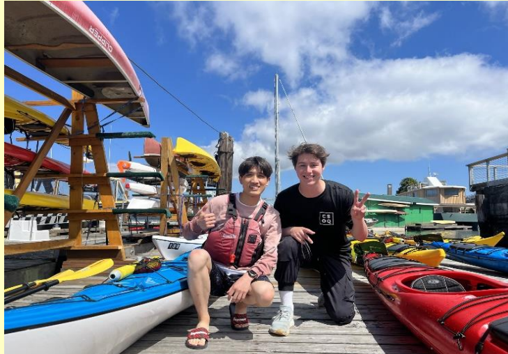
A photo with an international student in my program

During the one-month journey in Victoria, I participated in many different activities, including English classes with international students, a professional communication course, and volunteering in a local charity. Apart from the regular activities structured by the hosting unit, I also joined many optional activities hosted by UVic, such as a downtown walking tour in Victoria, a visit to Butchart Garden, whale watching, kayaking, and the thrilling three-day trip to Vancouver. Throughout the one-month journey in Victoria, I made friends with local Canadians and connected with students from around the world, such as Brazil, Japan, Korea, and Portugal. This experience helped me understand more about other cultures, which are very different from Hong Kong. I learned the importance of cultural integration, cultural perseverance, and cultural respect.