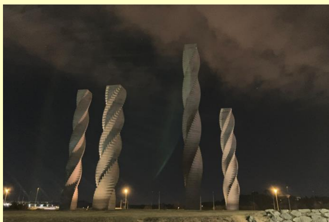
The Bellaterra Columns

Of course, I miss Hong Kong. The convenience found in Hong Kong is incomparable, even to downtown Barcelona. I also miss the diverse variety of food. Although Barcelona has various restaurants, they tend to cater more to local palates. And, I admit, I am not a good cook. Beyond the tangible, my connections to friends, family, and my girlfriend feel weakened. I missed the birth of my friend's first child. I couldn't be there to take care of my family when they were in need. And maintaining a long-distance relationship with my