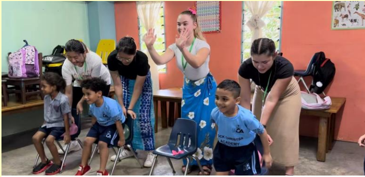
Playing games with kids

The Sports Education project involved participating in sports activities like volleyball, rugby, soccer, and jump rope with local residents at the field near the volunteer center. Additionally, we visited schools to engage in physical education sessions with the students. The local people exhibited impressive athleticism and a deep passion for sports. Despite the absence of professional facilities and equipment, their passion for sports has seamlessly integrated into their daily lives. One woman even humorously commented, "In our volleyball matches, the team that loses has to cook dinner."