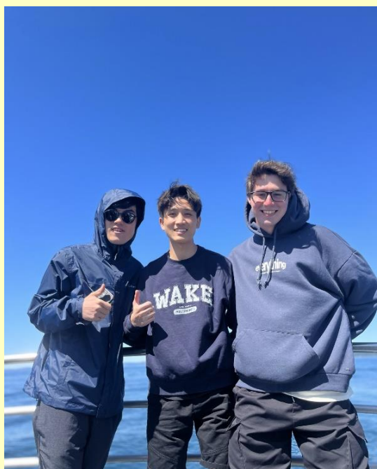
My friends from other countries

Canada Place's architectural marvel and scenic waterfront views provided perfect photo opportunities. Cycling through Stanley Park, the city's largest urban oasis, was an unforgettable