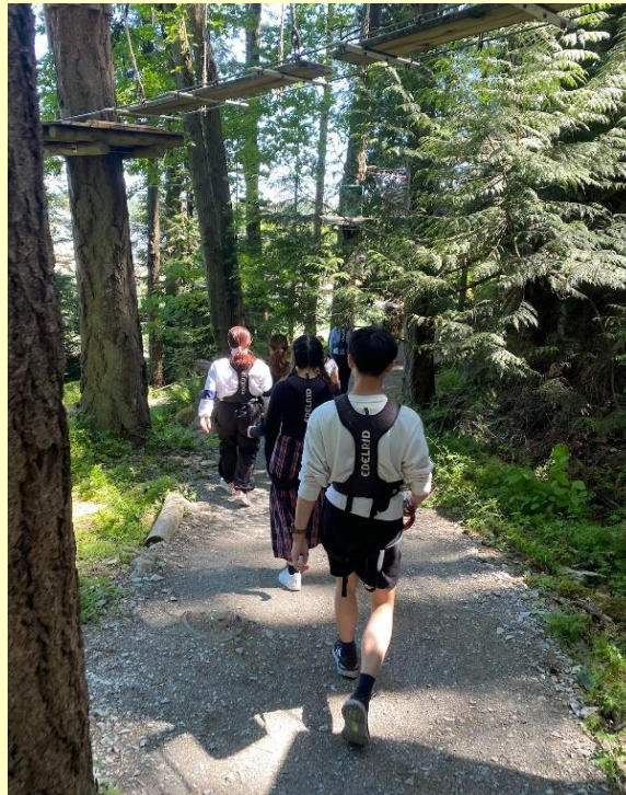
A Nature Walk