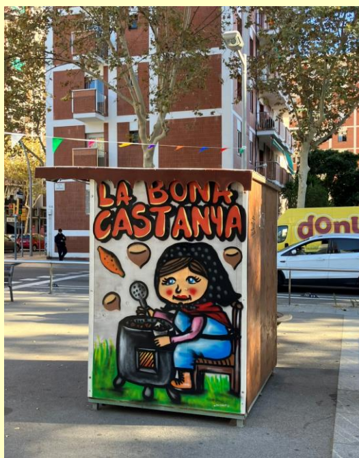
Catalan version of roasted chestnut

Adapting to the new environment took me a few weeks. Although I knew that people mainly speak Catalan and Spanish here, I was still shocked by how hard communication could be. Shops start closing after 2:30 pm, so you really need to plan your day well. The relative cost of dining out and buying ingredients has made self-cooking a necessity. But bulk purchasing takes a lot of effort, and I wished I had a driver's license. Now, I've gotten used to it and feel comfortable with my surroundings. All it takes is time.