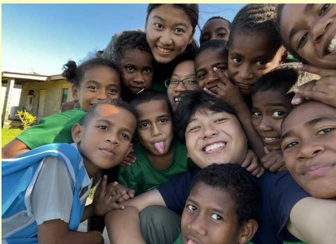
Visiting schools for physical education

As our program neared its end, on the last Friday, we embarked on a community visit to a nearby