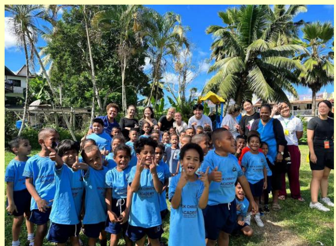
Sports Day for kindergarten kids