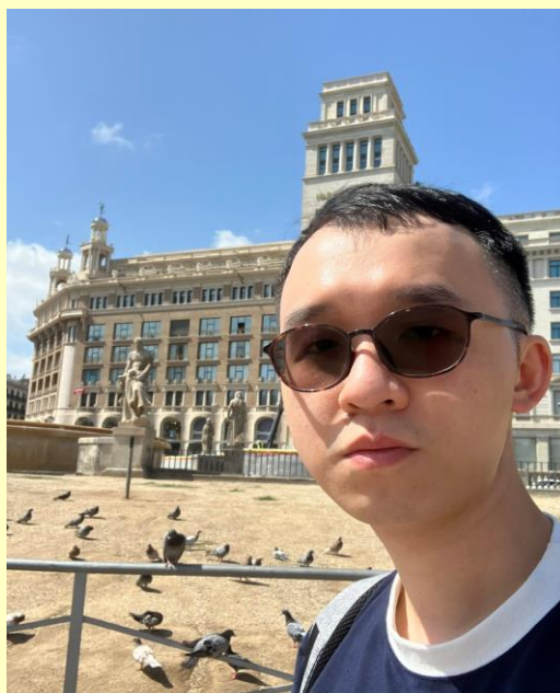
My first day in Plaza de Catalunya

If you had told me a year ago that I'd be dedicating two years to a research master's in economics in Barcelona, I would have been surprised. Yet, here I am, grinding through the textbooks and tackling academic challenges. A year ago, I was an employee in a back-office role. While there were highlights, like completing improvement projects or addressing clients' urgent requests, my days inevitably revolved around the predictable rhythm of back-office tasks. It was during a particularly monotonous day at work that the realization hit me: I craved more than just routine. My plan was to gain new job experience in a different area. I knew I desired intellectual challenges, but I doubted my chances of being accepted into an overseas master's program. However, the thought persisted, and I started researching it. After gaining a firmer belief, I began consulting with professors for help, and they kindly offered advice and assisted with the applications. Even as I type this, the journey amazes me. It truly underscores the idea: you won't know unless you try.