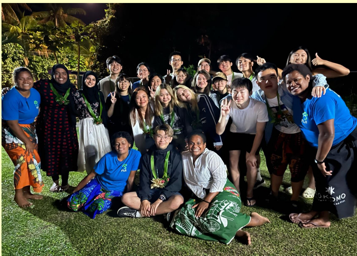
A group photo of CityU volunteers and coordinators from The Green Lion