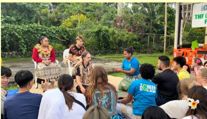
Simulated wedding ceremony and drinking kava

In the course of my interactions with the local teacher, she said, "Teaching these children often requires raising your voice and being strict, which can be exhausting. However, even if I'm absent for just one day, I find myself missing them dearly."