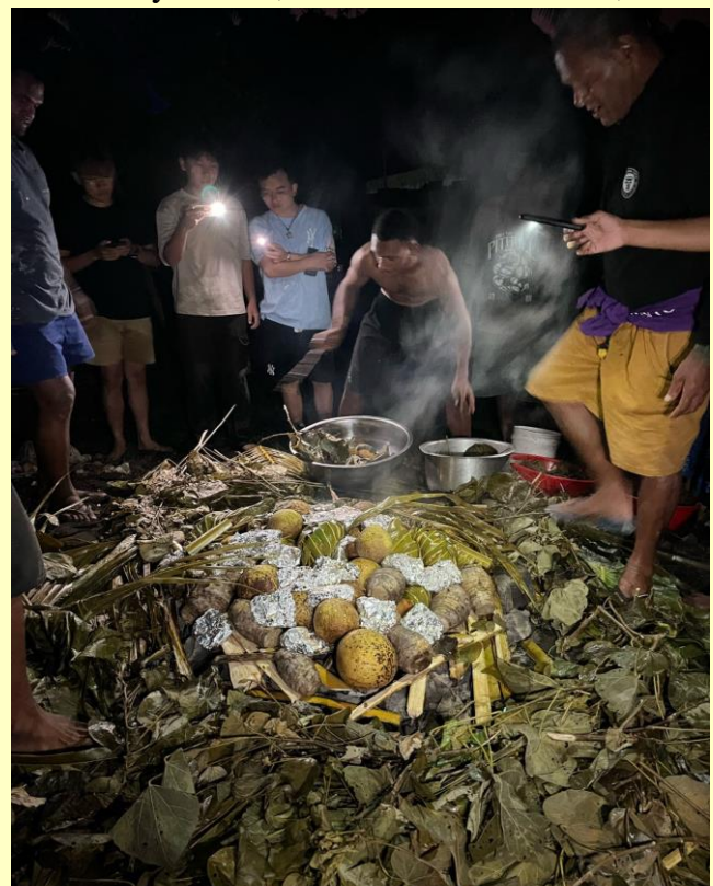
The traditional dinners prepared by villagers for us

I strongly recommend this summer program for four compelling reasons. Firstly, it offers a prime opportunity to enhance your volunteer service skills, providing meaningful community engagement and skill development. Secondly, it immerses you deeply in the local culture through community visits, cultural ceremonies, and