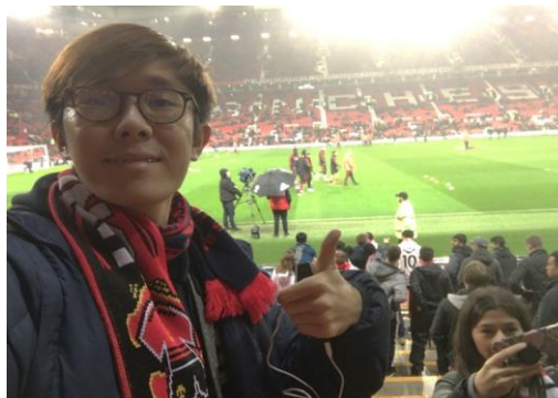
Old Trafford, Manchester United FC Home Stadium, United Kingdom