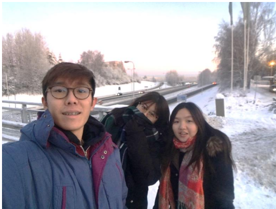
Santa Claus Village, Rovaniemi, Finland

Among all the places I visited, watching a football match in the Manchester United Home Stadium was my most precious experience! As a fan of Manchester United, stepping into the Dream Theatre made my dream come true! In fact, I ticked off some of my life bucket list items during my study abroad: watching Aurora and snow in Finland, climbing the highest mountain in Germany (i.e. Zugspitze), standing in front of Eiffel Tower, etc. All these journeys added beautiful colors to my exchange program and made it an unforgettable memory in my life!