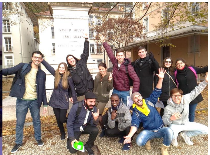
Classmates & buddies in Grenoble