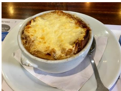
French Onion Soup

Another interesting aspect in this area was lunchtime. Over there, no one works during lunchtime, even students. At the University, there is a fixed lunchtime in the timetable (i.e. 12:15pm – 1:15pm). There will be no lessons during this one-hour period. It is so different with the situation in Hong Kong, where University students do not have a fixed lunchtime. For instance, here in Hong Kong, I tend to eat my lunch in 10 minutes time, because the next lesson nearly commences. In addition, everyone has a different schedule here, and no fixed time.