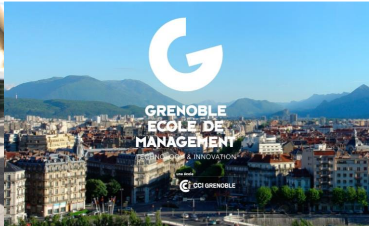
Grenoble École de Management, Grenoble, France