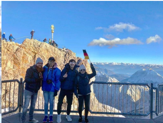
Zugspitze, Top of Germany