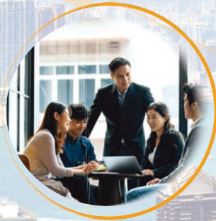
✓ People Management