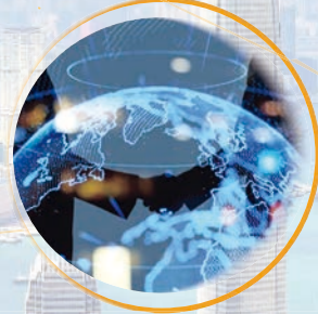
✓ International Management