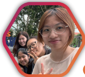
National University of Singapore

"Beyond the croissants and champagne, this journey taught me independence and adaptability while showing me how to connect across cultures. In simple moments-like a Parisian baker patiently explaining the art of French pastries-I gained my most profound insights. Exchange isn't just about studying abroad; it's about discovering yourself through new experiences that reshape how you see the world."