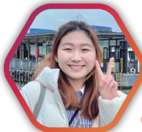
Aston University, United Kingdom

"I am grateful for the lifelong friendships I forged, the rich local culture I explored, and the profound personal development I experienced. This exchange has instilled a more positive and proactive outlook, providing a comprehensive foundation for my future growth. Overall, it was an enriching adventure that I will cherish forever."