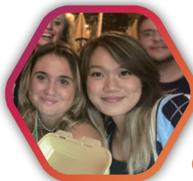
Institut d'Études Politiques de Paris (Sciences Po), France

"I thoroughly enjoyed the interactive nature of the course, from cunning tactics in negotiations to discussions about career development and job environment differences. This exchange journey nurtured my personal development and ignited career aspirations, especially with final-year students surrounding my academic experience."